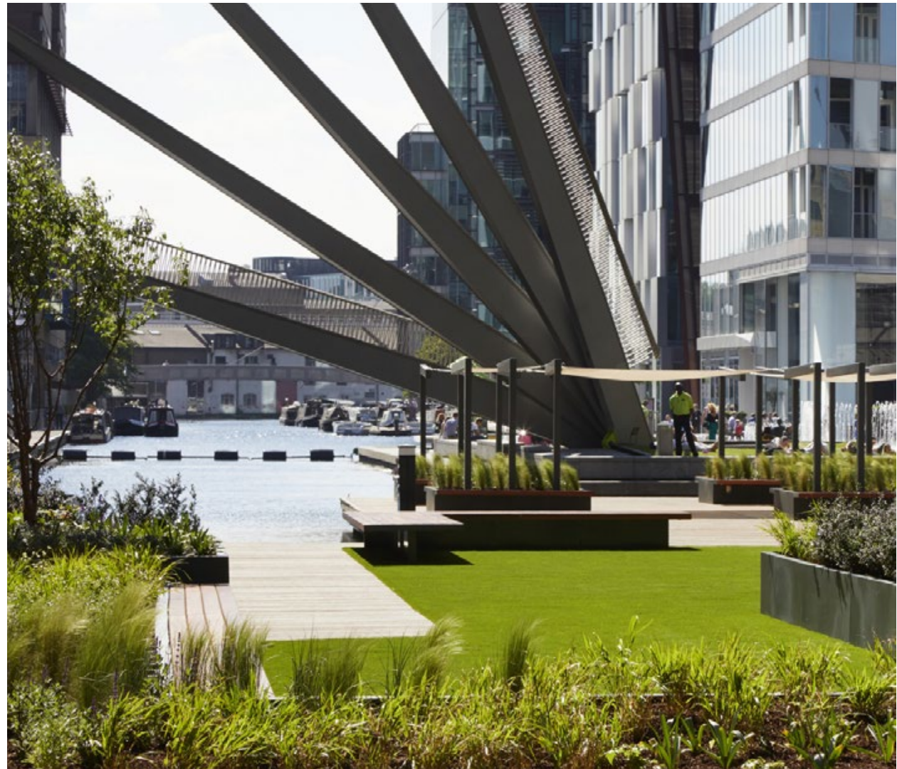
↑ Paddington Basin and The Merchant Square is now almost unrecognisable after a complete transformation.