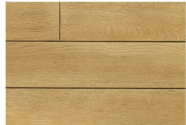
⬆ Enhanced Grain Golden Oak

“We were looking for an authentic and durable decking material to realise our client’s ambitions for creating a new public space floating above water at Merchant Square in Paddington. Real timber would not be able to meet the operational and maintenance requirements of the space and many composite products simply looked cheap or unattractive.” - Ben Dewhirst, Landscape Architect